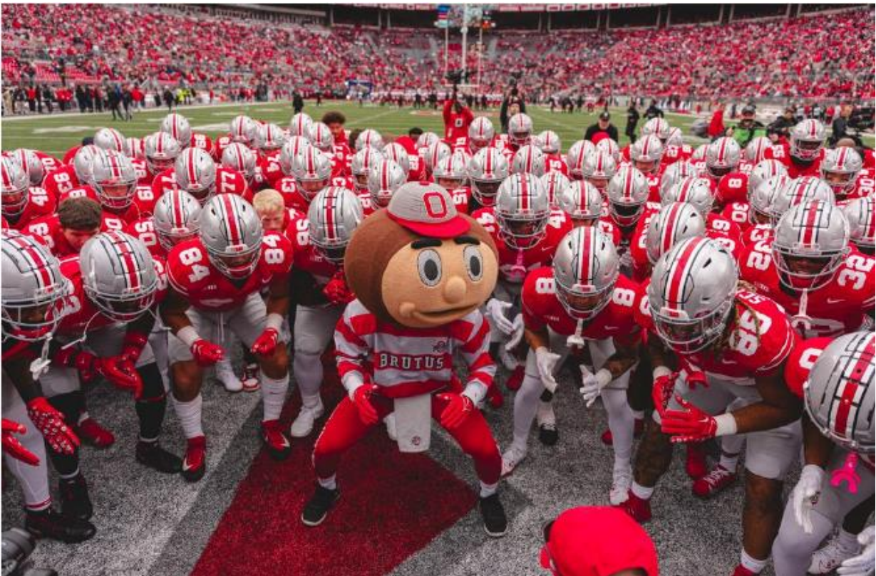
Ohio State Buckeyes - Ohio State vs. Maryland